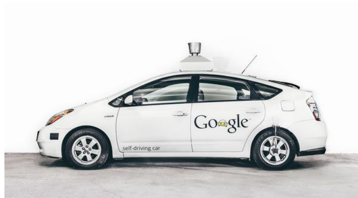
Google Self-Driving Car Prototype from 2009 ( Source )

Google has close ties to one of the most advanced AV technology in the market, Waymo. Now owned by Google's parent company, Alphabet, Waymo began as Project Chauffeur, an experimental project under Google's X lab for nearly 10 years. In 2016, Waymo spun out into a stand-alone company.