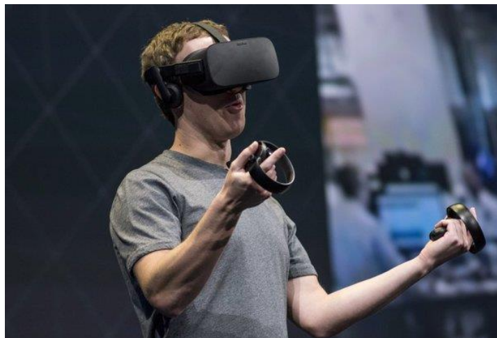
Facebook CEO Demonstrating their Oculus VR Headset ( Source )

While Facebook hasn't publicly announced any self-driving technology initiatives, speculation has been going around for years. Three years ago, Facebook's COO Sheryl Sandberg made a surprise appearance at the Frankfurt Motor Show, spurring rumors about their interest in the automotive sector. Sandberg made it clear that Facebook had no plans to make cars, in fact joking, "we're the only company in Silicon Valley that's not building a car." That said, it is entirely possible they're involved in developing self-driving software given the company's deep knowledge in artificial intelligence.