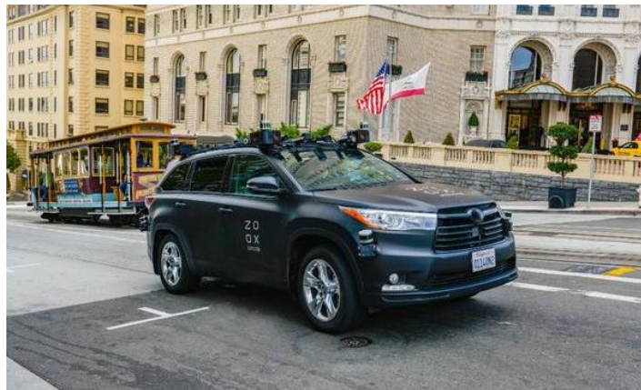
A Zoox Test Vehicle in San Francisco

roads in March, but the pandemic delayed those plans in addition to causing massive layoffs . Talks about an Amazon acquisition was reported soon after these layoffs.