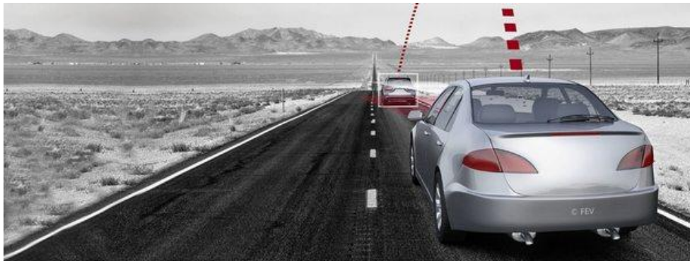
FEV Software, which uses Microsoft Azure

Microsoft, while also not building an AV themselves, is supporting OEMs and other automotive tech companies with their massive cloud computing resources. As the largest software company in the world, Microsoft offers a program for AV startup companies , as well as a connected vehicle platform powered by their Azure platform which competes with Amazon's AWS. Several OEMs and other industry companies including Renault Nissan, Volkswagen, Volvo, BMW, Ford, and Toyota are using Azure to further their AV development.